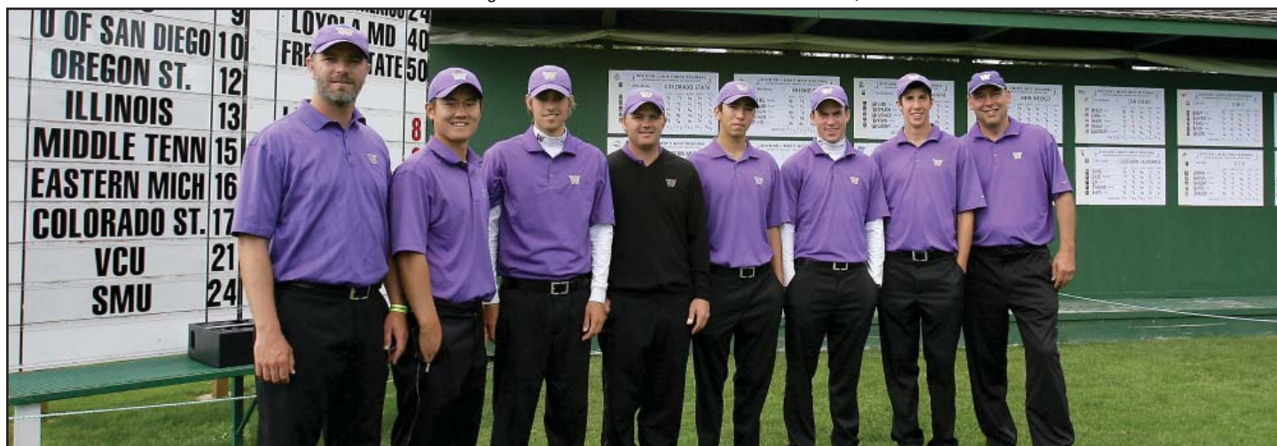
The 2010 NCAA West Regional Champions from Gold Mountain Golf Complex in Bremerton, Wash.